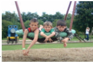
A swinging time at Mabie

Throughout the year the children have had several outings. At Easter, We took them to Dalscone Farm. During the summer there was a trip to Belfast Zoo. For many it was the first time on board a ferry. Later on there was an outing to Mabie Farm Park.