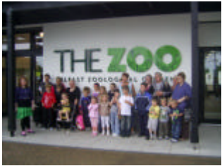
At Belfast Zoo

Throughout the year the children have had several outings. At Easter, We took them to Dalscone Farm. During the summer there was a trip to Belfast Zoo. For many it was the first time on board a ferry. Later on there was an outing to Mabie Farm Park.